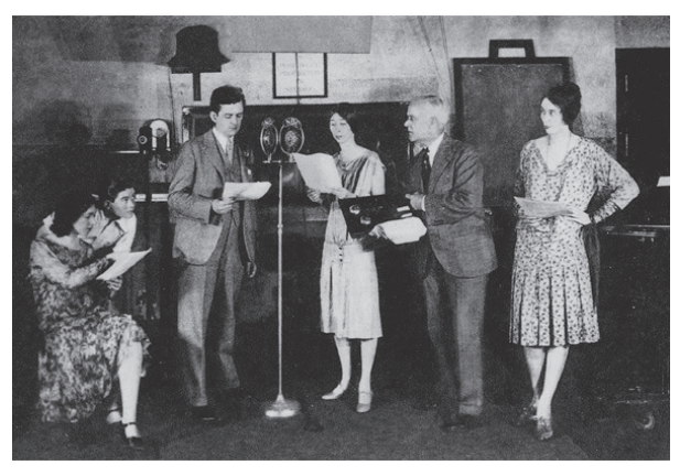
Actors performing a live radio broadcast in the 1920s

Many of the earliest radio plays and similar performances were often done by members of theatre groups for little or no money who organised themselves into radio players or radio club performers, and it became quite common for many radio stations to have their own in-house performers. It was these 'radio players' who were the true pioneers in Australia of radio 'acting' and by the early 1930s many actors had graduated into full-time radio performers, often forming their own companies.