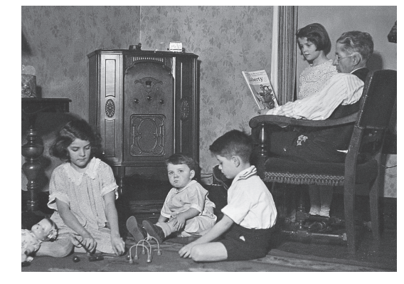
Listening to the radio in the 1920s

On this historic occasion not all listeners who heard the inaugural broadcast were within the