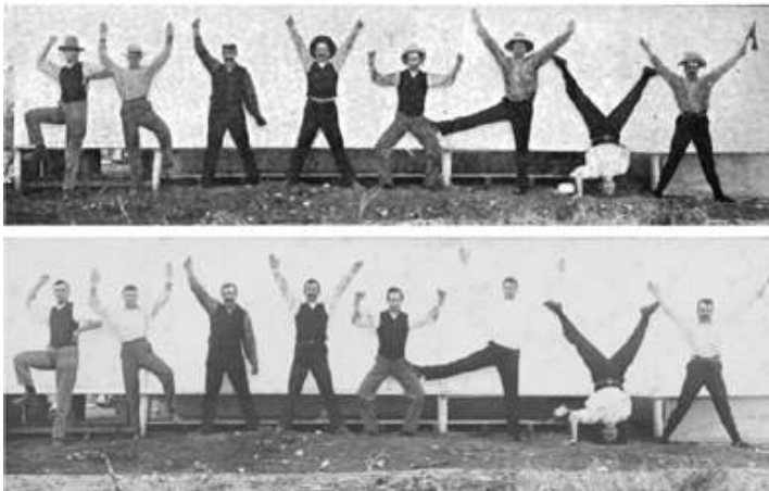
Figure 3 - A comparison of the Strand Magazine photograph in August 1904, and the Sherlock Holmes pub photograph.

Things became more confusing when comparing the pub photo with the published Strand photograph (Figure 3 below). The pub photo is understandably more clear than the small grainy Strand photo. Both