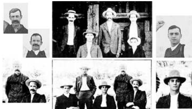
Illustrations of 'Official Staff, Lakeside' from the Kalgoorlie Western Argus , 17 th March 1903 (centre upper) and 21 st June 1904 (centre lower). At left and right are comparisons of men from the official staff photographs, with the Dancing Miners photograph.