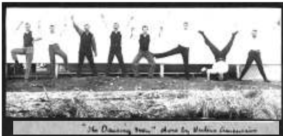
The original cabinet card photograph taken by H. H. Grose, and held in the Lucens collection.

Laurence Pernet, who worked at the Conan Doyle archives in Lausanne, stepped in to help. Included in the Lausanne archives are some of the framed pictures that were exhibited in New York in 1952, including the one of the Dancing Miners. It is identical to the framed picture in London, with the caption in a matte window below the picture. Laurence also found the original ‘hatless’ photo mailed from Australia in the Lucens collection. 9 As produced by H.H. Grose, the photograph is pasted on a brownish cardboard bearing an ink stamp of the photographer’s name on the lower left corner (“H. H. Grose. PHOTO”). Directly beneath the photograph on the card, in what is clearly Arthur Conan Doyle’s own hand, is written “The Dancing men done by Western Americans”. The rear of the cabinet card is blank.