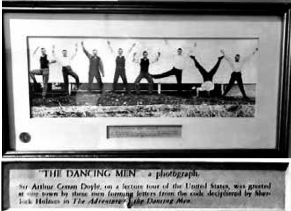
The framed photograph on the stairway of the Sherlock Holmes pub, London.

stairway. I absent-mindedly took a photo on my phone, impressed that the Australian miners were being shown so far from home, and continued up the stairs.